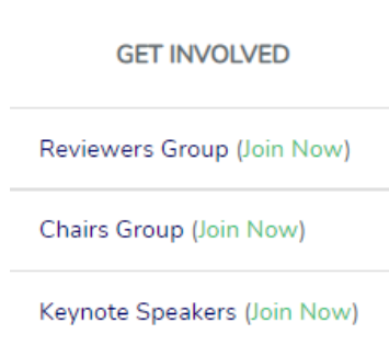
Fig.2 Submenu of GET INVOLVED